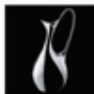
Rare Georg Jensen Henning Koppel water pitcher, 1948