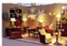
Epoca

Epoca (San Francisco, CA) who participated for the second time brought a mix of antiques and 20 th century pieces. A pair of gorgeous mahogany-veneered Art Deco Modern chairs from Paris got a lot of attention, but had sold right after opening to a local interior designer. Bunny Williams also had her eye on a pair of Italian 19th century olivewood-veneered consoles.