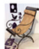
Maison Jensen Campaign chair in steel and brass, 1930s at Downtown