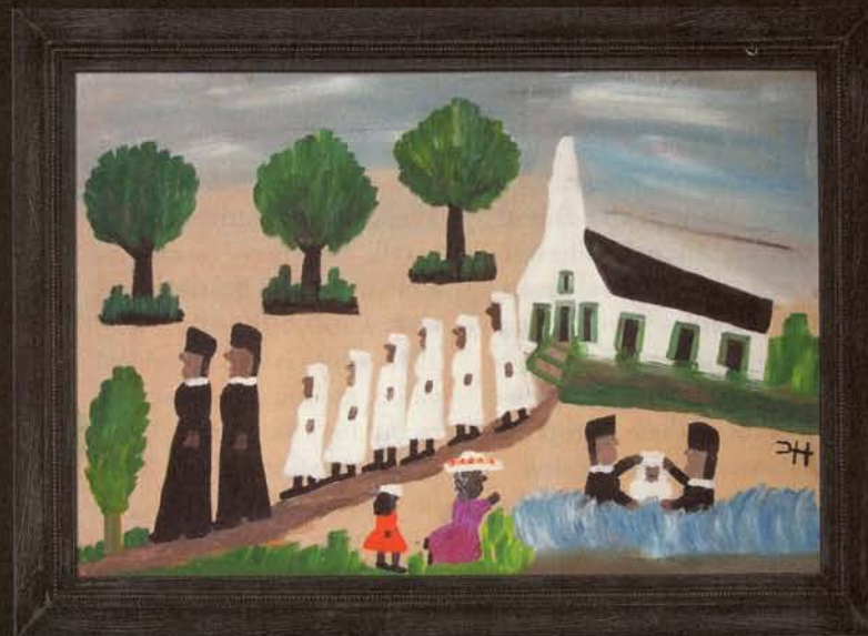
Clementine Hunter • Baptism • 16" x 24" • Oil on Panel

Be sure to visit our booth at the INTUIT SHOW OF FOLK & OUTSIDER ART November 4-6, 2011 Navy Pier's Festival Hall - Chicago, IL