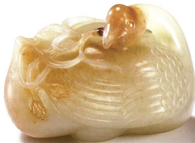
Above, left: Pair of Spanish Neoclassical Gilt-Gesso and Pink Marble Bilbao Wall Mirrors, 1800-09 at International Fine Art & Antique Dealers Show. Right: Jade carving of a gosling, Qing Dynasty, at Fine Art Asia.