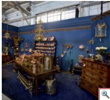
Eve Stone Antiques of Connecticut displayed 16th - 19th century antique brass, copper and lighting