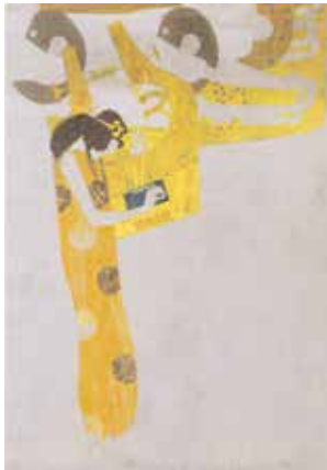
Gustav Klimt (1862–1918), Die Poesie (detail of the Beethoven Frieze), 1901–2, gold, graphite, and casein paint on canvas, 9 ft. 4 in. x 7 ft. 1 in., Secession, Vienna

INFORMATION: 600 Museum Way, Bentonville, AR 72712, 479.418.5700, crystalbridges.org