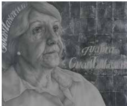
Lauren Amalia Redding (b. 1987), Echar mis versos del alma (To Cast My Soul's Verses) , 2017, silverpoint and silver leaf on gessoed panel, 20 1/2 x 24 1/2 in.

INFORMATION: 385 Broome Street, No. 2, New York, NY 10013, 908.642.4791, edmondrochat.com