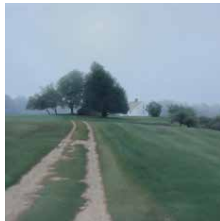
Brett Scheifflee (b. 1986), Pettengill Farm (Robin's Nest) , 2017, oil on panel, 22 x 22 in.

INFORMATION: 2 Park Walk, Chelsea, London SW10 0AD, England, UK, 44.207.352.2733, cricketfineart.co.uk