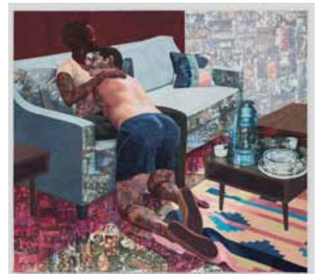
Njideka Akunyili Crosby (b. 1983), Ike Ya , 2016, acrylic, transfers, colored pencil, and charcoal on paper, 84 x 92 in., Hammer Museum, Los Angeles

INFORMATION: 1700 NE 63rd Street, Oklahoma City, OK 73111, 405.478.2250, nationalcowboymuseum.org