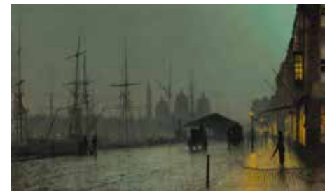
John Atkinson Grimshaw (1836–1893), Prince's Dock, Hull , 1882, oil on board, 11 3/4 x 20 in., MacConnal-Mason Gallery

INFORMATION: 2 Marina Boulevard, San Francisco, CA 94123, 415.392.7600, sffas.org