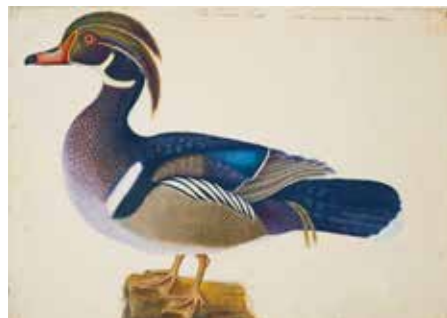
Mark Catesby (1682–1749), The Summer Duck , c. 1722–26, watercolor and pencil on paper, 10 1/4 x 14 1/4 in., Royal Collection Trust

INFORMATION: 58 Park Avenue, New York, NY 10016, 212.779.3587, scandinaviahouse.org