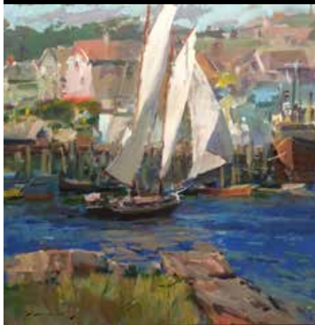
Charles Movalli (1945–2016), Heading for Port , 2016, acrylic on canvas, 36 x 36 in.