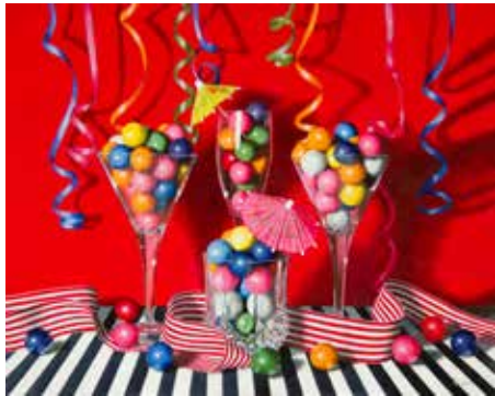
Karen Budan (b. 1948), Gumball Fiesta , 2016, oil on panel, 16 x 20 in.

INFORMATION: 125 West Palace Avenue, Santa Fe, NM 87501, 505.501.6555, sorrelsky.com