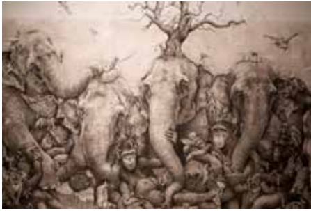
Adonna Khare (1980), Elephants (detail), 2012, pencil on paper, 89 ft. 7/8 in. x 32 ft. 3 in.