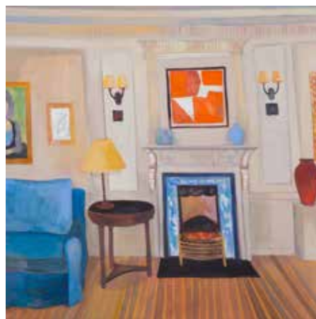
Lottie Cole (b. 1973), Interior with Sandra Blow , 2017, oil on canvas, 39 1/2 x 39 1/2 in.

INFORMATION: 366 West 7th Street, San Pedro, CA 90731, 562.246.7915, msartgallery.com