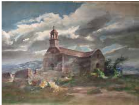
Lumen Martin Winter (1908–1982), Unidentified Church, New Mexico , c. 1965, watercolor on paper, 30 x 40 in., Long Island Museum, gift of Alexander Katlan

INFORMATION: 1071 Fifth Avenue, New York, NY 10128, 212.423.3500, guggenheim.org