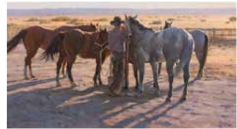
Tom Browning (b. 1949), The Horseman , n.d., oil on canvas, 20 x 36 in.

One of America's foremost annual Western art sales, Cowboy Crossings , will be hosted by the National Cowboy & Western Heritage Museum. On offer are more than 150 works encompassing the Cowboy Artists of America's 52nd Annual Sale & Exhibition (mostly paintings, drawings, and sculpture), as well as the Traditional Cowboy Arts Association's 19th Annual Exhibition & Sale (saddles,